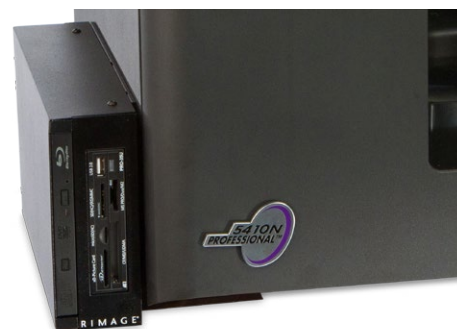
Evidence Media Reader